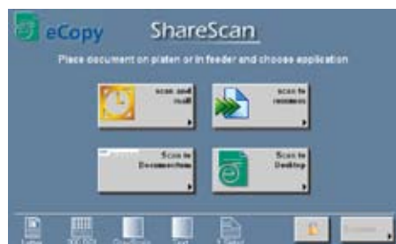
eCopy ShareScan for Canon MEAP Screen Shot

eCopy Singapore Level 42, Suntec Tower 3 8 Temasek Boulevard Singapore 038 988 Tel: +65 6829 2191 Fax: +65 6829 2121