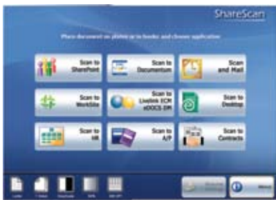
eCopy ShareScan Screen Shot

eCopy OnSite personnel are experts in document handling and can provide a variety of product related services, including: